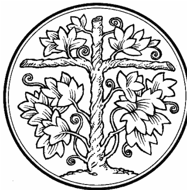
Tree of Life